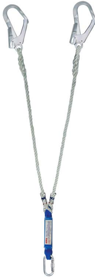
W1-E-D-H3101/AF09 (2013 V. EF-32)

OTHER CONNECTORS ON REQUEST (Please refer to Page 50~56.)